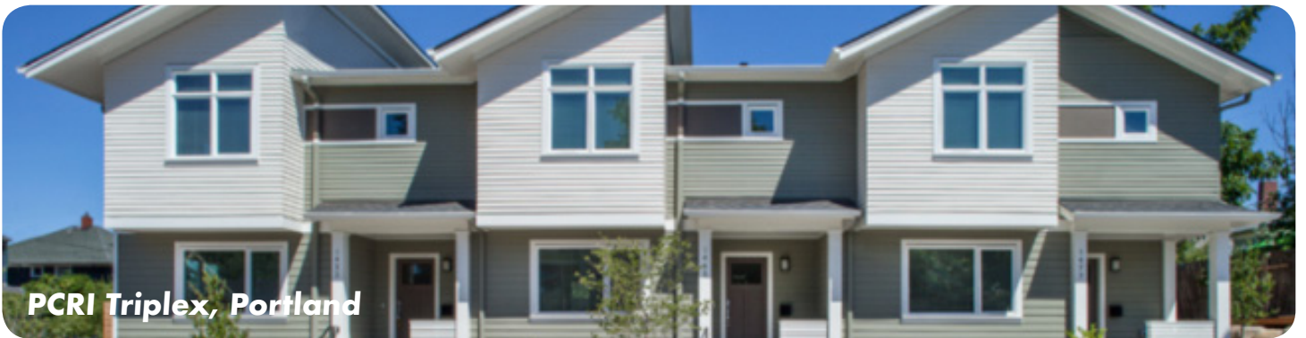
PCRI Triplex, Portland