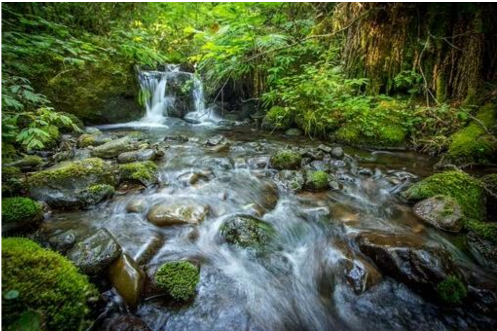
“The Bull Run River starts as a series of springs in the temperate rainforests around the watershed.”

We have a strong, resilient water system to steward and maintain. We urge Portland City Council to take more active positions in advocating for policies and investments that protect Mt. Hood National Forest and our primary water source. There have been increased legislative threats to Mt. Hood National Forest and water resources, particularly from the federal government 5 . We also ask the City Council to note the strong foundation of our current water system without the Bull Run Filtration Plant.